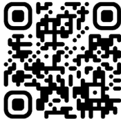
CONNECT CARD stpaulsorlando.com/connect

Use your phone's camera to quickly access the following resources or navigate to the URL below each QR code.