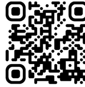
GIVE ONLINE stpaulsorlando.com/give