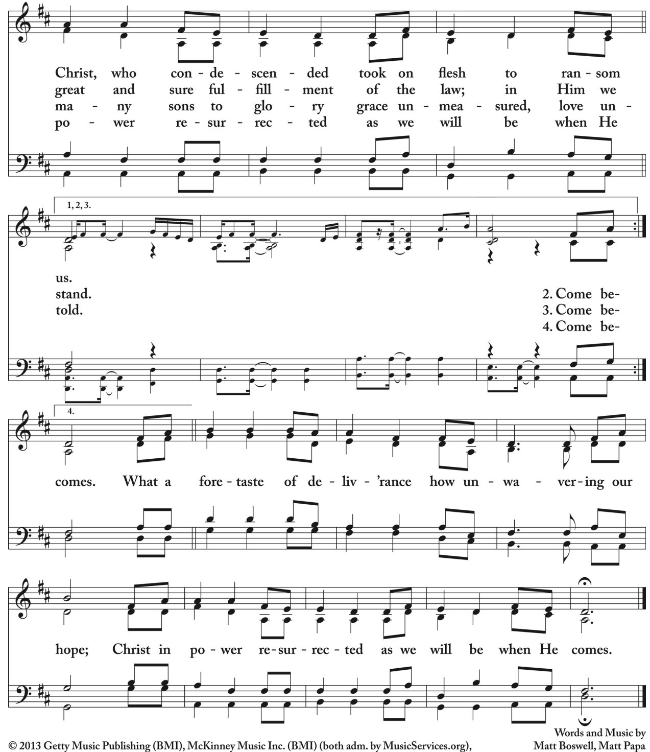
Love Your Enemies Publishing (ASCAP) and Bleecker Publishing (ASCAP)